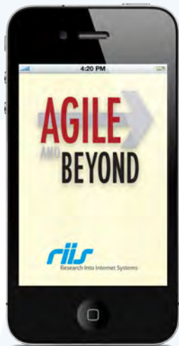
Agile & Beyond Mobile App